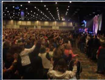
3,000 women worshipping